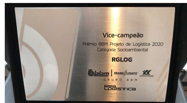
RG LOG – BBM Logistics Project Award 2020 in the Socio-environmental Category