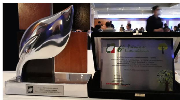
Jomed Transportes e Logística won the 6 th Sustainability Award of SETCESP & Modern Transport in the Environmental Responsibility Category

its greenhouse gas emission reports and for the “Estradas com Araucárias” Project. These are some examples that demonstrate that PLVB® member carriers are ready to begin the Green Seal Recognition System in Freight Transport, with the real possibility of good performances. It seems that 2021 will be a very promising year for all PLVB® members!